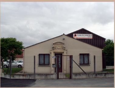
Railtechnique SARL (FR)