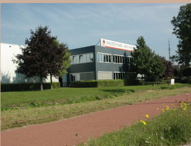
Railtechniek van Herwijnen BV (NL) Head Office