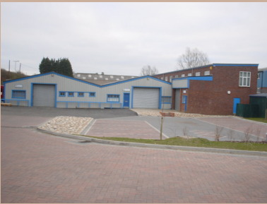
Stewart Gill Conveyors Ltd (UK)