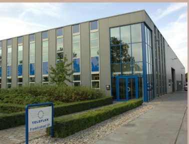
Teleflex BV (NL)