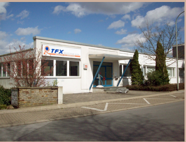
TFX Railtechnik GmbH (DE)

The Railtechniek van Herwijnen BV Group of Companies are specialists since their foundation in 1983 in the production and installation of Overhead Conveyor components and systems. The designs, manufactures and installs only under international approved standards.